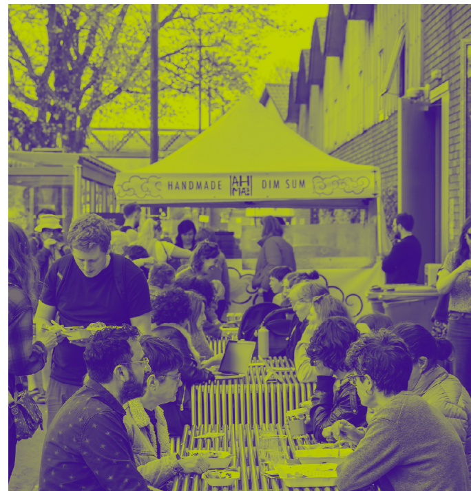
SPIKE ISLAND OPEN STUDIOS 2023.

Serving an exclusive Spike Island collaboration beer, featuring artwork by Spike Island studio holder Myrna Quiñonez