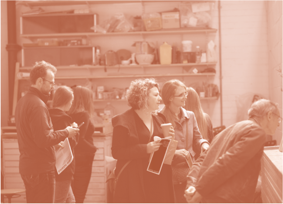
SPIKE ISLAND OPEN STUDIOS 2019.