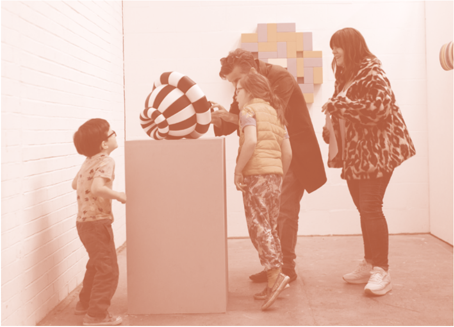
SEAMUS STANTON'S STUDIO, SPIKE ISLAND OPEN STUDIOS 2019.

EMMELINE CAFÉ → E Open throughout Open Studios A fresh, bright and friendly community café bar with a focus on wholesome food and drink and conscious environmental practices.