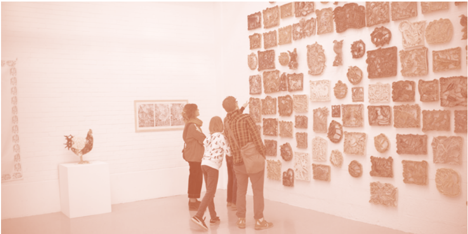
NICHOLAS WRIGHT, A CHANCE TO LOOK AT CHICKEN (2019). INSTALLATION VIEW.