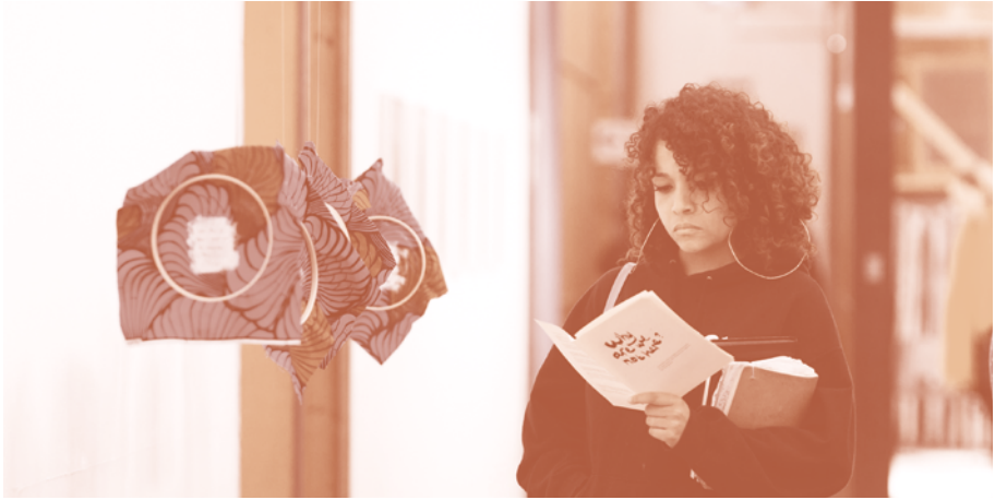
SPIKE ISLAND OPEN STUDIOS 2019.

UWE FINE ART STUDENTS → H ART MARKET Sunday 1 May, 12–4pm, UWE Fine Art Studios Browse through UWE Fine Art Students' most recent creations. Works for sale include prints, editions, ceramics and original pieces.