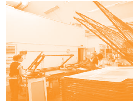
Spike Print Studio

This lucky dip guarantees you an original, limited edition unframed print generously donated by Spike Print Studio artists.