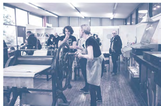
Spike Print Studio

Take part in activities and conversations about art and ideas as part of an ongoing project by Spike Associates, recently part of Tate Exchange, London. Activities include creating collaborative drawings and ephemeral sculptures, while random interventions take place (see a full schedule on the blackboard inside the space).