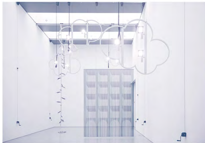
Giles Round They bow. Curtain. No applause. (2017) Installation view, Spike Island.

Exhibition continues until 18 June 2017.