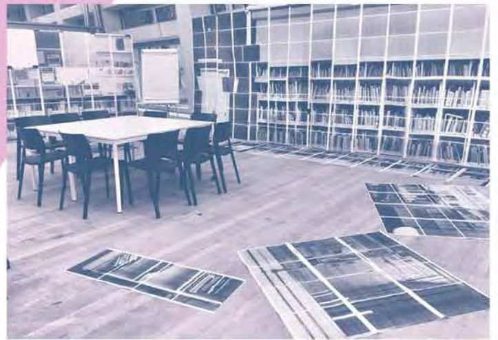
Spike Associates at Tate Exchange (2017)