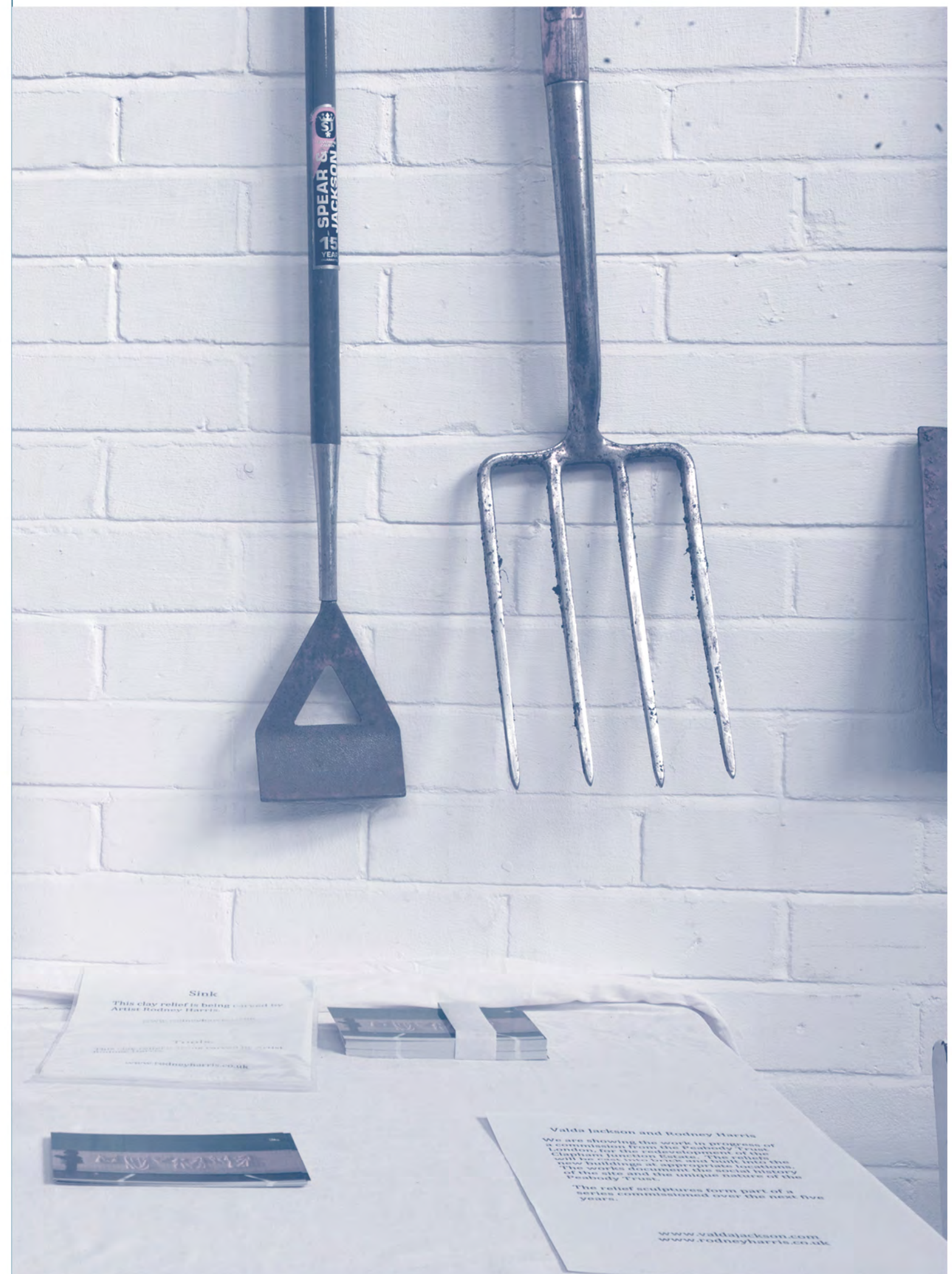
Inside Rodney Harris' studio 37, works in progress

Take advantage of £1 fixed price tickets from Stop 1 (Explore Lane, Millennium Square) to Stop 3 (Spike Island) throughout Spike Island Open, 28 April to 1 May 2017.