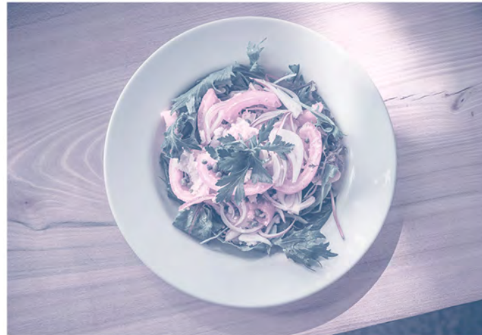
Spike Island Café

A cheese-lovers dream! Big bubbling pans of freshly cooked tartiflette, and melted raclette cheese straight off the grill served with rosemary potatoes, locally grown salad and homemade pickles.