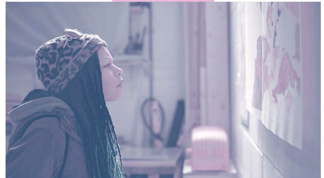
Rodney Harris' studio 37 (2016)